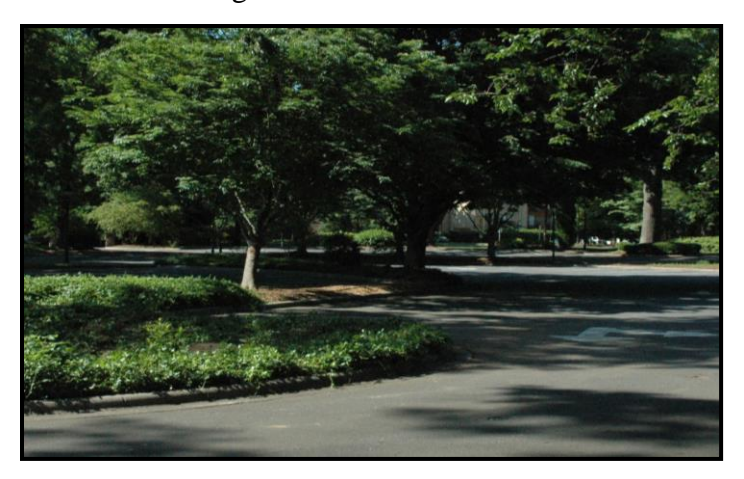
Figure 12.11-2: Example of parking lot broken up by landscaping.

12.11-3 Enclosure of Parking Lots. Parking lots shall be enclosed by tree planting and/or building walls(s). Plantings shall be in accordance with the provisions of Article 11, see 11.6-4. For small lots (thirty-six spaces or less), landscaping shall be required at the perimeter; for large lots (more than thirty-six spaces), landscaping shall be at the perimeter and placed to break the lot into parking areas of no more than thirty-six spaces.