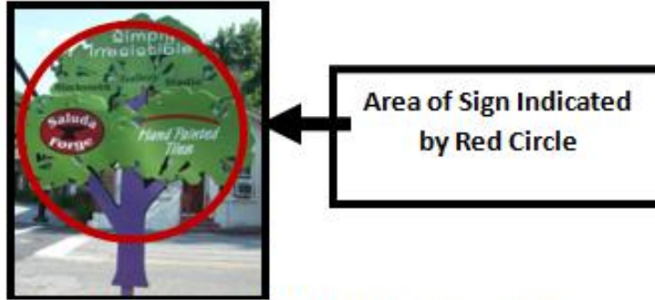
Example Illustrating Measurement of the Area of an Irregularly Shaped Sign

SIGN COPY. Any graphic design, letter, numeral, symbol, figure, device or other media used separately or in combination that is intended to advertise, identify or notify, including the panel or background on which such media is placed.