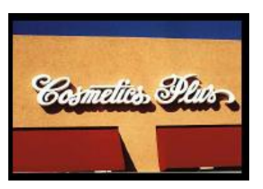
Overly-Complicated Style of Text

(4.) Avoid elaborate or confusing styles of text as illustrated in the following example.