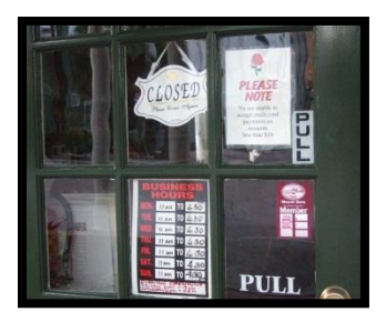
Example of Incidental Signs

(G.) Incidental signs affixed to windows containing no more than two square feet in copy area provided that not more than a total of six (6) square feet of incidental signage is displayed per occupancy. An incidental sign may flash provided they are located within a building and no more than one such sign is displayed per occupancy.