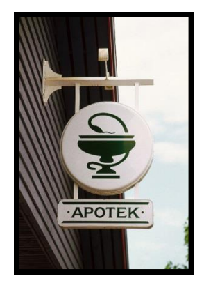
Use of Symbols

(6.) Use sign styles and designs that complement the architecture of the site where the signs are located. Morven is a historic Town so using "period" signage is strongly encouraged.