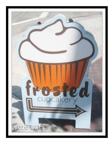
Example of Alternative Sandwich Board Sign

(G.) Alternative design for sandwich board signs . As an alternative to the standard design described above, the Planning, Zoning & Subdivision Administrator may permit alternative sandwich board sign designs which exhibit a distinctive and creative flair which the owner would otherwise be unable to replicate if the standard frame design was used. Such signs shall not contain changeable copy and images and lettering shall be permanently attached, painted, cut or carved onto the sign using a muted palette of colors. Wooden signs are preferred, but all such signs shall be made of durable materials. An example of an acceptable alternative design is illustrated in the following photograph.