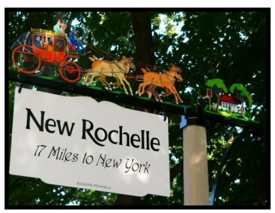
An Example of a "Period" Pole Sign in a New York City Suburb

(6.) Use sign styles and designs that complement the architecture of the site where the signs are located. Morven is a historic Town so using "period" signage is strongly encouraged.